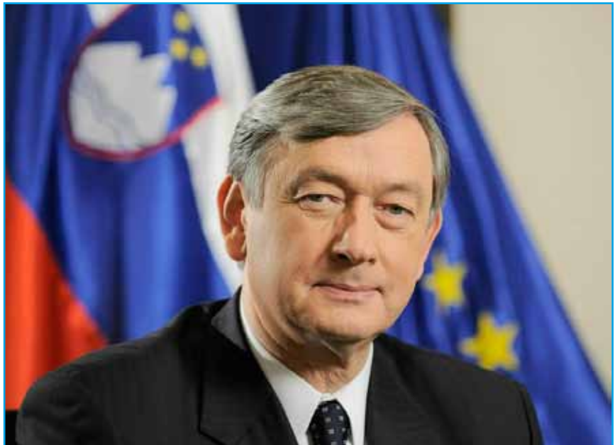
Dr. Danilo Türk.

At the gala dinner on Friday, April 11, the participants were addressed by the Slovenian international law expert and former president of the Republic of Slovenia, Dr. Danilo Türk. The event was attended by many judges and former judges of the International Court of Justice, other international courts and tribunals, representatives of academia, lawyers working in foreign ministries and international organizations, and