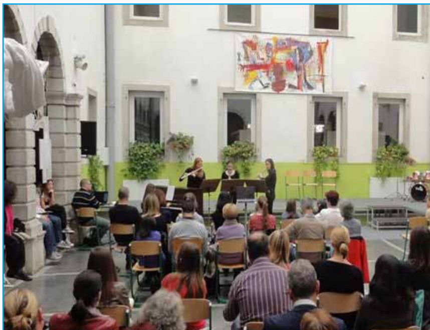
Concert in Koper, Slovenia.

It was an anticipated -- and long-awaited -- balmy Saturday evening, April 12, at The Firehouse Space in trendy Williamsburg, Brooklyn, the center of New York's new music scene. Musicians, composers, and members of the local New York Slovene community gathered for a concert featuring three of Slovenia's