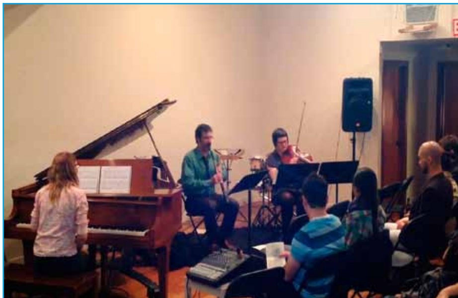
Concert in New York.