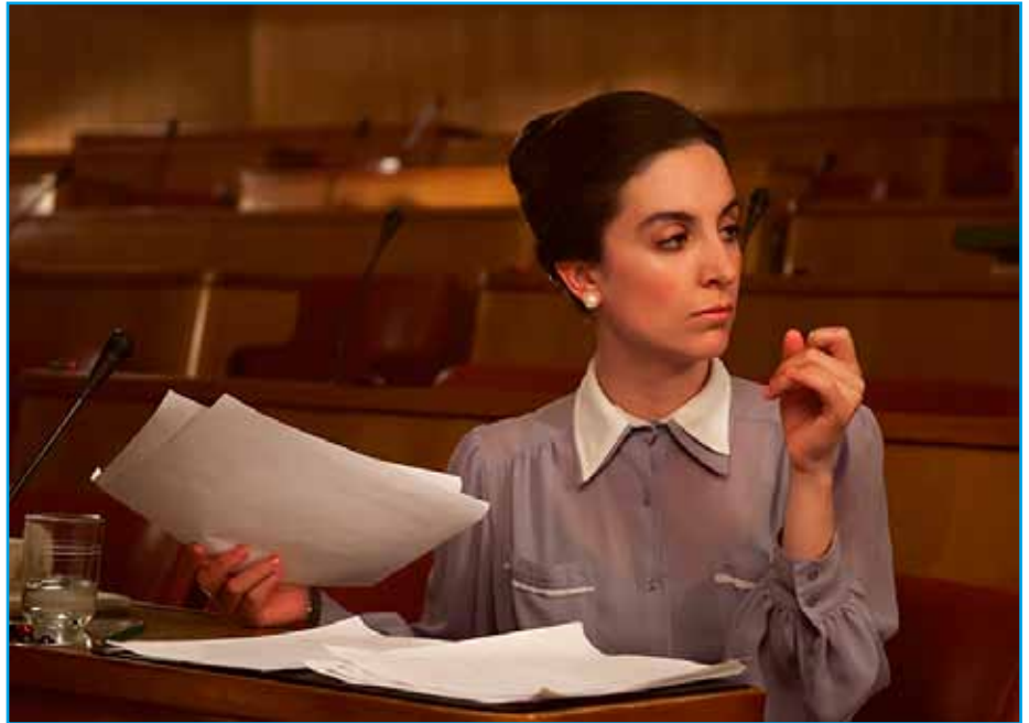
Scene from J.Cibic: Fruits of Our Land , Single channel HD video, 11 min 43 sec, 16:9, stereo, 2013

The opening was very well attended and the project was very well received. In attendance was a mixture of New York and European curators and artists as well as art world insiders. The opening