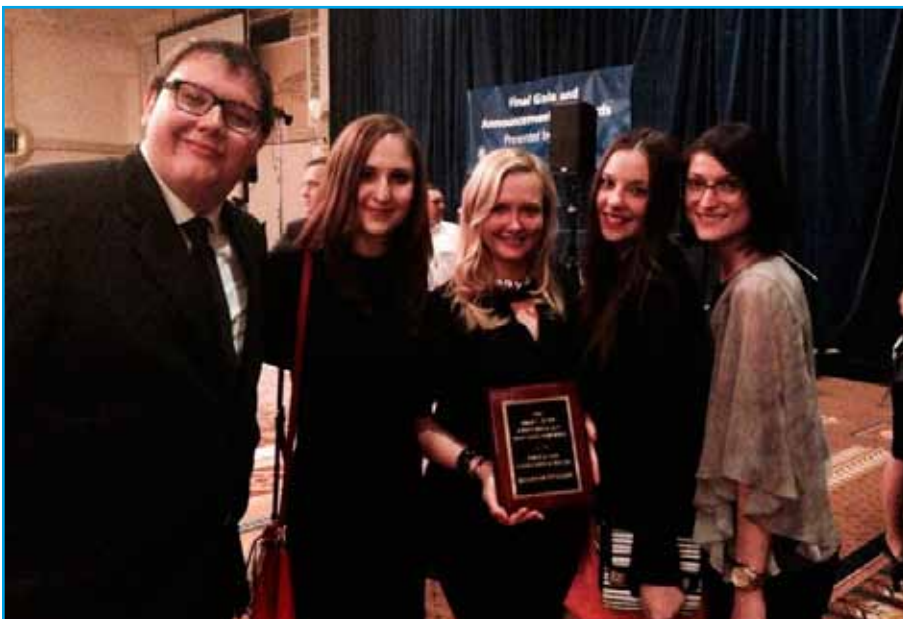
The Slovenian team again proved to be among the best teams in the world and achieved an outstanding 5th place in overall rankings.

The Jessup competition is an opportunity for students to learn the law and effectively use the gained knowledge in order to successfully represent and advocate the positions of states. It provides a platform to practice teamwork while also giving the students a chance to meet their peers and law professors from all over the world. At many events organized during the competition, the students get an opportunity to network, while, at the "Go National Ball", they model traditional outfits of their respective countries. The Slovene traditional costume was provided by the embassy and proved to be quite a hit at the ball.