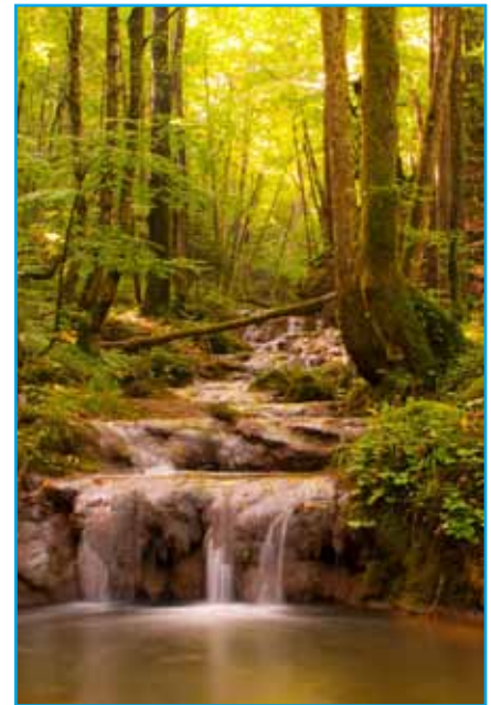
Divji potok stream.