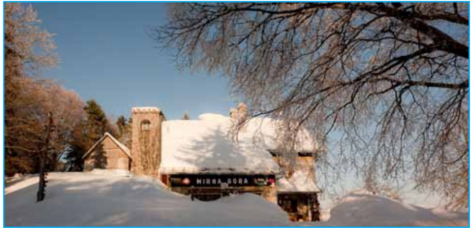
Mirna gora.

of Mirna gora is a favorite goal of many hikers in Bela krajina. The forests surrounding the mountain are a part of the vast Rog forests, which form one of the largest forested areas in Europe when counted together with those of the neighboring dinaric plateaus. The area surrounding Mirna gora offers countless well maintained and richly equipped educational, hiking, and horseback riding and cycling trails; in Gače above Črmošnjice there is also a ski-center.