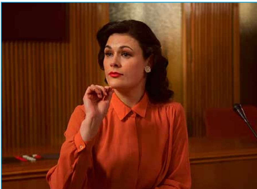
Scene from J.Cibic: Fruits of Our Land , Single channel HD video, 11 min 43 sec, 16:9, stereo, 2013

The exhibition remains on display till May 11, 2014, at LMAKprojects, 139 Eldridge Street, New York, NY 10002.